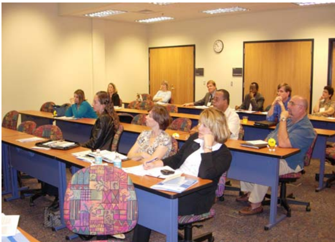
Conference goers listen in at one of the many informative educational sessions.